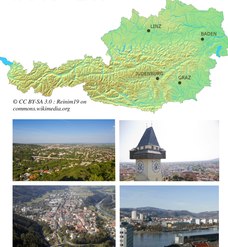
Figure 1: top left: Baden; top right: Graz; bottom left: Judenburg; bottom right: Linz

Judenburg is located within the "Niedere Tauern" - mountain area in the Alpine climate zone and Baden near Vienna in the Pannonian climate zone.